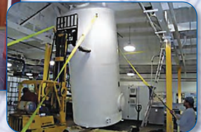
This glue tank installation was performed for an adhesive vendor, on-site at their client's manufacturing operation.

(908) 537-4350 • www.amianoconstruction.com