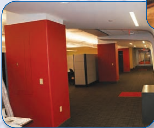
Akzo Nobel, Bridgewater