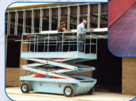
Electric indoor and outdoor scaffold for high work