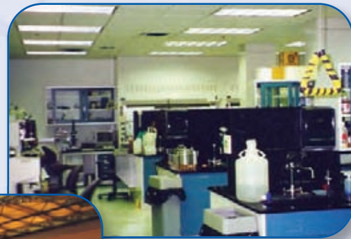
Miscellaneous laboratories in Bridgewater, NJ