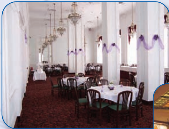
The historic Altamont hotel located in Hazleton, PA renovation project included restoration of the large dining area.